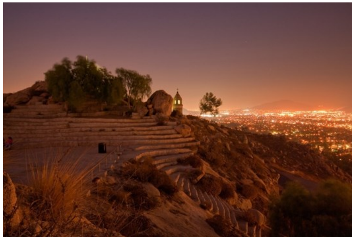
Enjoy a sunset walk up Mt. Rubidoux while you take in the view of Riverside.

#3: We know about the California Gold Rush of the mid-1800s, but did you know that California had a second "Gold Rush" in the early 1900s? The second rush was not for a precious metal but for agriculture—citrus fruit, to be exact. The California Citrus State Historic Park tells the story of the citrus