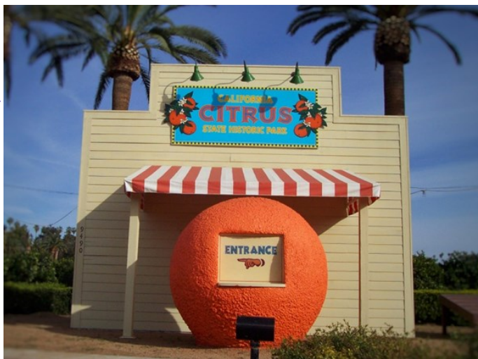
Learn about California's flavorful history at the California Citrus State Historic Park.

#1: Last but definitely not least is the