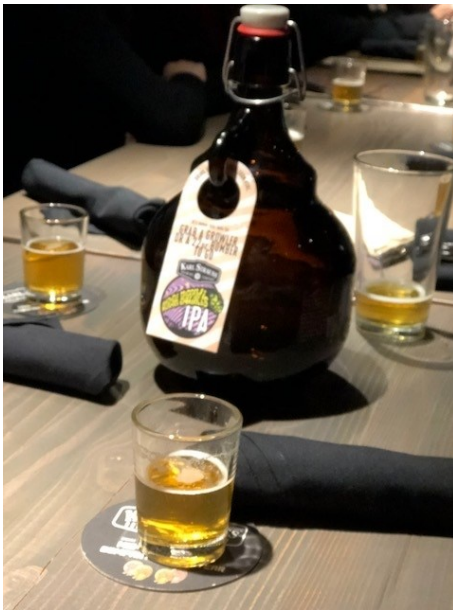
Tasty beverages.

This year's SCALL Holiday Party was on January 9, 2018 at the Karl Strauss Brewery in downtown Los Angeles. This is the second year at that venue and was a great success once again. About 40 SCALL members came together to wish each other a happy new year, to reconnect with colleagues, to enjoy the tasty food and beer, and also to celebrate the 65th Anniversary of