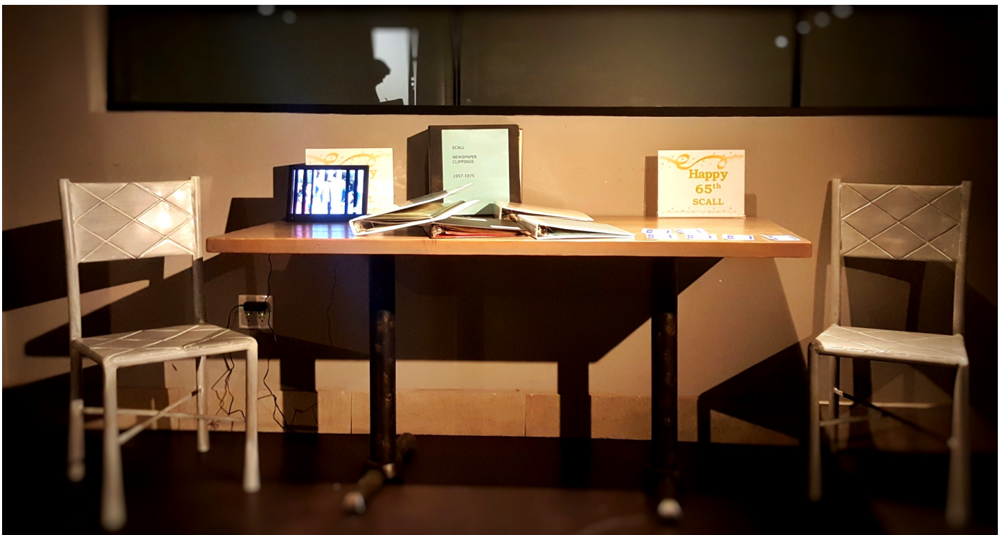
The Happy 65th SCALL Table.