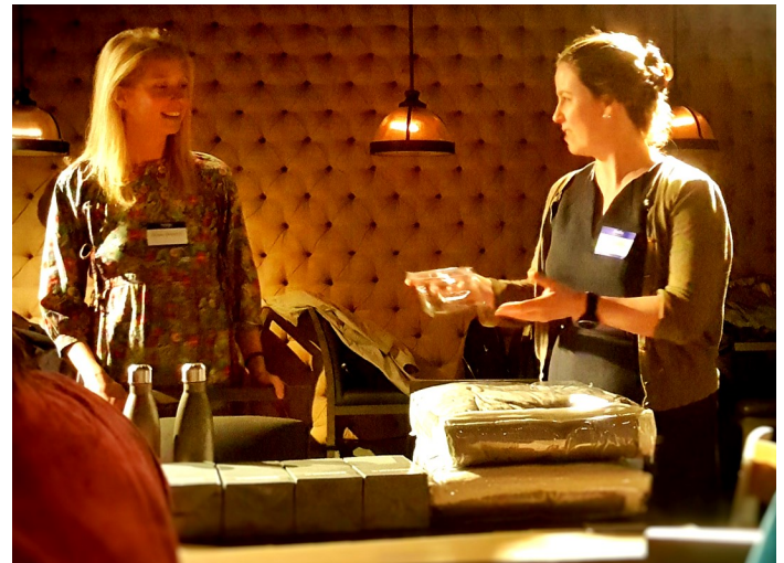
The Programs Committee distributes vendor prizes.

This year's SCALL Holiday Party was on January 9, 2018 at the Karl Strauss Brewery in downtown Los Angeles. This is the second year at that venue and was a great success once again. About 40 SCALL members came together to wish each other a happy new year, to reconnect with colleagues, to enjoy the tasty food and beer, and also to celebrate the 65th Anniversary of