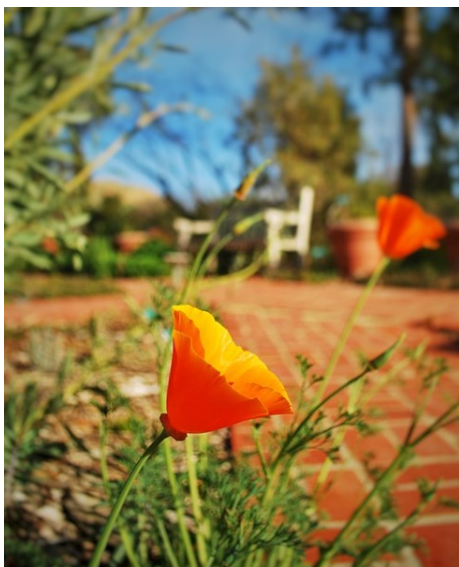
Stroll along the trails or just relax on a park bench at the UCR Botanic Gardens.

#9: You may know that Riverside's name takes inspiration from the Santa Ana River, but did you know that you can actually walk along this river on more than 25 miles of nature trails at the Hidden Valley Wildlife Area ? Located along the Santa Ana River on Arlington Avenue, this park allows you to enjoy peaceful views of the river while escaping the city noises for a while.