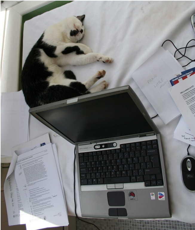
"Working from home" by StripeyAnne is licensed under CC BY-NC-SA 2.0