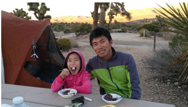
A Lee family camping trip at Joshua Tree National Park.

continued from page 5 (Member Spotlight)