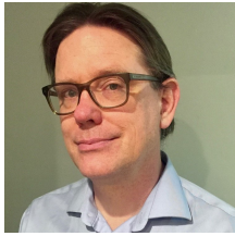
From the President