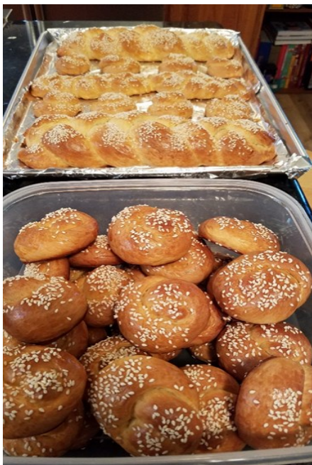
Delicious Armenian pastries.

As we continue sheltering in place, we are starting to see a reopening of the state. Who knows what the long-term fiscal effects of COVID-19 will be, but I hope SCALL 2020 is not the last time we gather. Since there will be no AALL in New Orleans in 2020, here's to hoping to see you all at SCALL 2021. But please, someone tell Docket Navigator we'll need a bigger bottle of hand sanitizer next year!