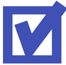
Meet the Candidates