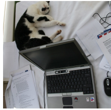
Communication in the Time of COVID-19